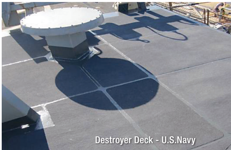
Destroyer Deck - U.S.Navy